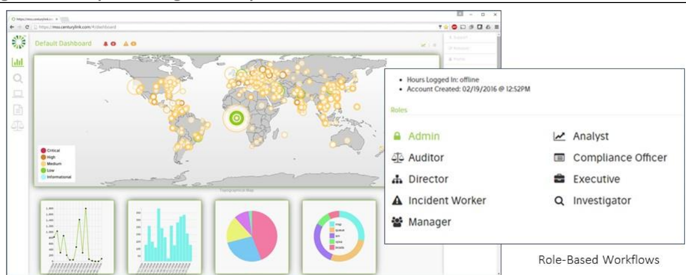
Figure 3. CenturyLink Managed Security Services Portal